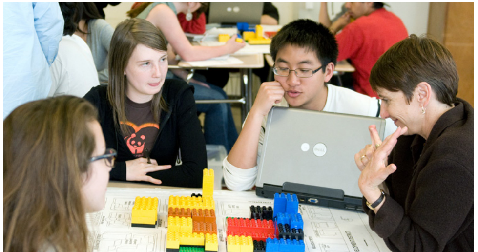
High School Students with UrbanPlan Volunteer Facilitator

UrbanPlan is a project-based learning curriculum developed for high school juniors and seniors in economics or government classes, and for university graduate-level students studying land use who are focused on disciplines in business, city planning, real estate, architecture or law. During the project, students develop a proforma and model of their plan for an urban infill, mixed-use redevelopment project, and present their proposal to a mock City Council that awards the development contract to the winning team. The mission of UrbanPlan is to develop a more educated citizenry at the local level around the challenges and complexities of land use decisions so together we can create better communities. UrbanPlan is facilitated by volunteers who are professionals in all disciplines of land use and development, selected for their depth of experience and knowledge.